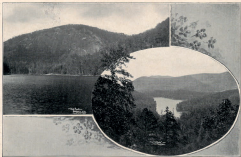
GLIMPSES OF LAKE FAIRFIELD