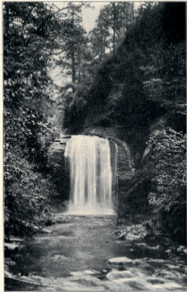
LOOKING-GLASS FALLS, BREVARD, N. C.