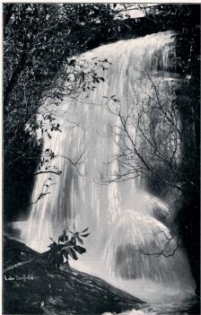
FALLS AT THE HEAD OF LAKE FAIRFIELD