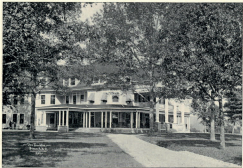
THE FRANKLIN, BEYVARD, N. C.