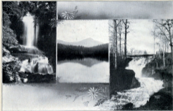
HEADWATERS OF LAKE FAIRFIELD