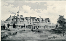
FAIRFIELD INN, RAPPAHANNOCK, N. C.