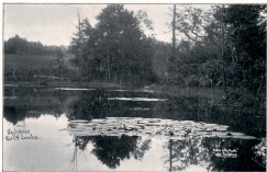
A CORNER OF SAPPHIRE LAKE NEAR THE GOLF LINKS