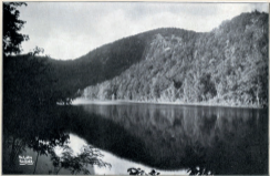
FAIRFIELD LAKE AND BALD ROCK