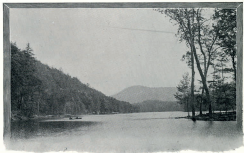
LAKE FAIRFIELD LOOKING EAST