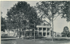
THE FRANKLIN, HENRYARD, N. C.