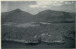
FAIRFIELD VALLEY, LAKE FAIRFIELD AND FAIRFIELD INN CHIMNEY TOP IN THE DISTANCE